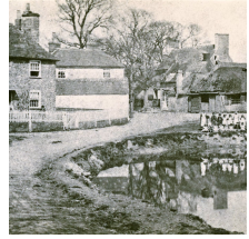
This month's photo